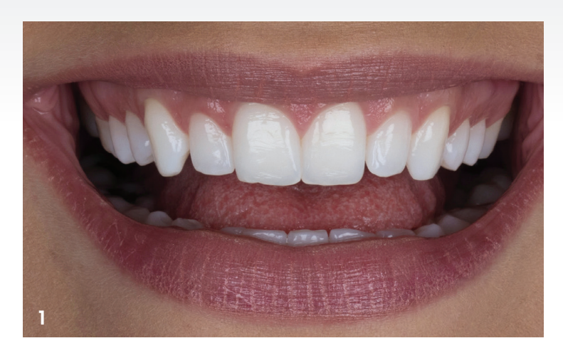
Figure 1: Preoperative view. The patient wanted more attractive upper anterior teeth.