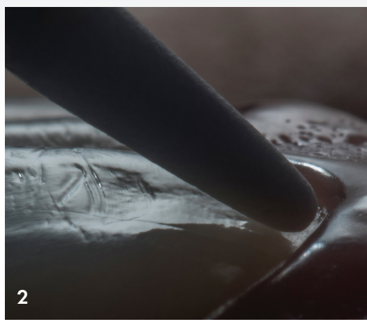
Figures 2 and 3: Slight preparation of the cervical margin with Arkansas stones.