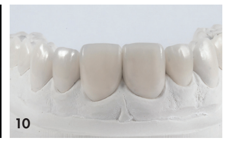
Figure 9: Spruing of the restorations for the Figure 10: Finishing of the ceramic veneers on the model.

a minimal thickness of 0.3mm offered an ideal basis for manually shaping the actual veneers (Fig. 5). Only very little wax had to be applied to achieve the ideal proportions. The shape of the teeth was adjusted with wax in the incisal and proximal areas in particular. The aim was to create an even appearance of the vestibular surfaces from the UL5 to the URS (Figs 6 and 7).