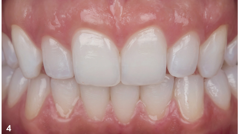
Figure 4: The teeth prepared for the veneers.