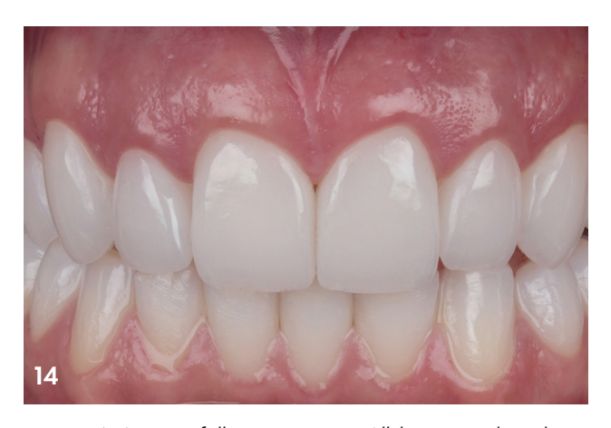
Figure 14: Situation following insertion. All the veneers have been cemented in the mouth.

Modern ceramic materials such as IPS e.max Press allow teeth to be restored with minimally invasive techniques. Even ultra-thin veneers (minimum thickness of 0.3 mm) can be produced. The ceramic restorations are cemented with the matching Variolink Esthetic luting composite. The single-component glass-ceramic primer offers the possibility of