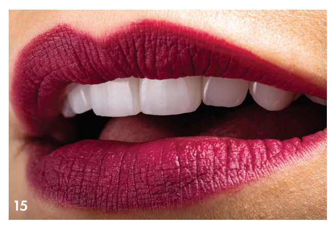
Figure 15: The satisfied patient. Her wishes have been fulfilled with minimally invasive restorations.