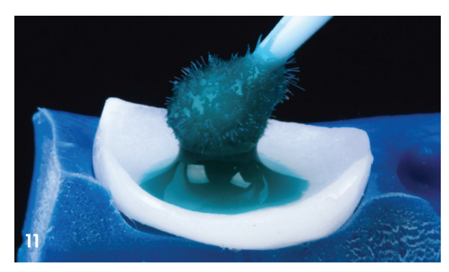
Figure 11: Application of Monobond Etch & Prime.

The adhesive cementation of ceramic restorations is a technique-sensitive procedure. In order to achieve a longlasting bond, it is of utmost importance to prepare this step carefully and to observe the cementation protocol. The single-component ceramic primer Monobond Etch & Prime was used to condition the ceramic restorations. The primer was scrubbed into the contact surface with a microbrush for 20 seconds in order to remove any saliva and silicone residue (Fig. 11) . During the 40-second reaction time, the etchant enlarged (roughened) the surface and produced an etching pattern. Next, the primer was rinsed off and the restoration was dried with a stream of air for 10 seconds. Then the reaction between the silane and the activated