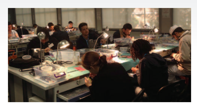
Figure 3: Students during a hands-on session in the lab.

to their Master's degree. It was very gratifying to see these students progress in this vertical linked training programme.