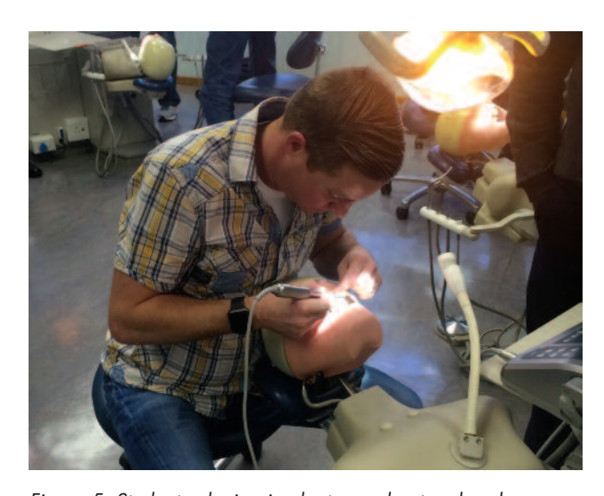
Figure 5: Students placing implants on phantom heads.